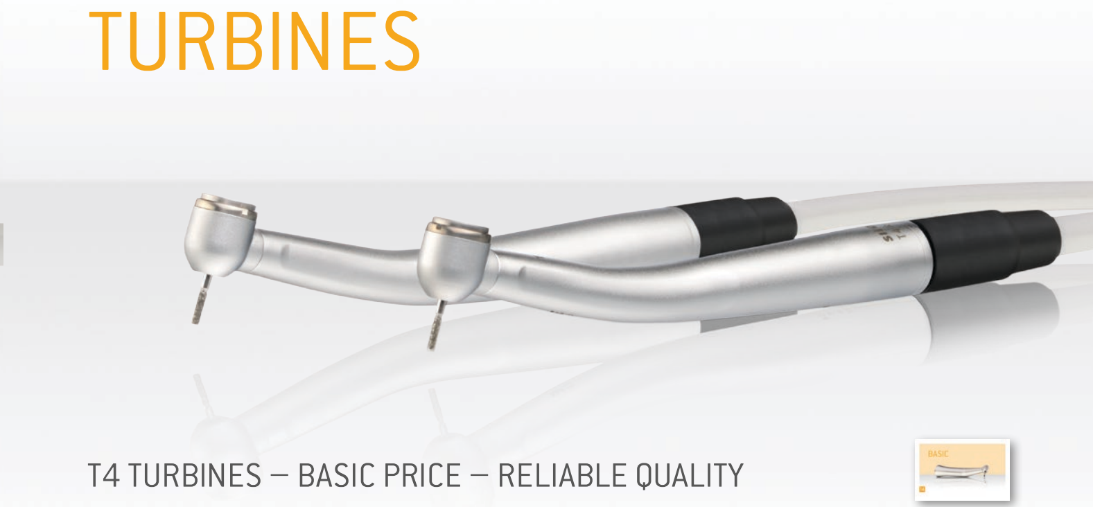
T4 TURBINES – BASIC PRICE – RELIABLE QUALITY

The highspeed handpiece of the T4 class convinces with its combination of an essential design and exceptional high power level of up to 17 watts. Regardless which treatment unit you use, with Midwest 4-hole and Borden 2-hole you have always the right choice.