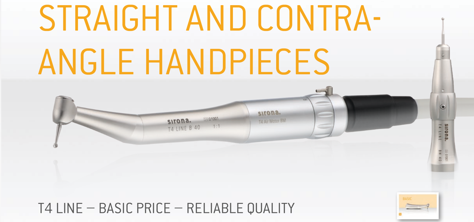
T4 LINE – BASIC PRICE – RELIABLE QUALITY

The straight and contra-angle handpiece of the T4 class delivers with an essential design and a robust steel sleeve. Due to the air motor – available with Midwest 4-hole or Borden 2-hole – you will stay flexible, regardless of the treatment unit you are using.